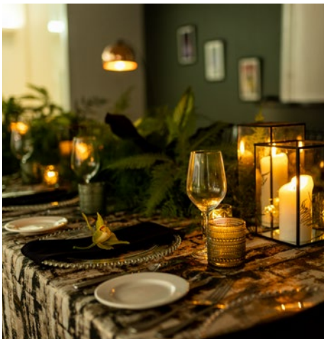
Behind the Glass Gallery – Dining and Conference Room