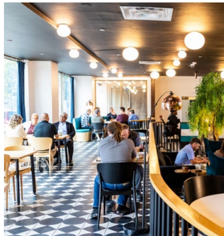
Main Street Riser