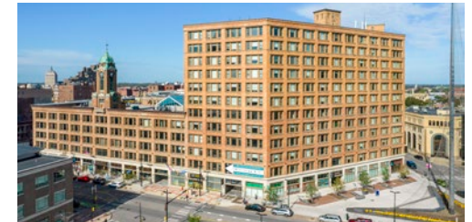
Sibley Square is the epicenter of activity and creativity in Rochester's NEW downtown.